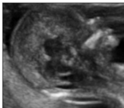
Pozicija fetusa za procenu IT

zona između dve ehogene linije; posteriorna granica moždanog stabla pred i horoidni pleksus četvrte moždane komore pozadi.